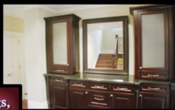
The soaring 2-storey foyer opens to a state of the art kitchen and family room. The stunning master, with vaulted ceilings, has a lavish 5-piece ensuite. With 4-bedrooms and 4-baths, plus a fully finished lower level, this home has it all!