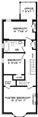
SECOND FLOOR 798 SQUARE FEET